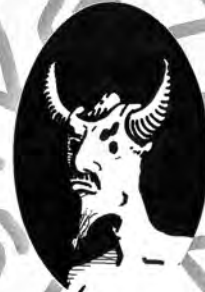
Jarvis - Earl of Half- truths