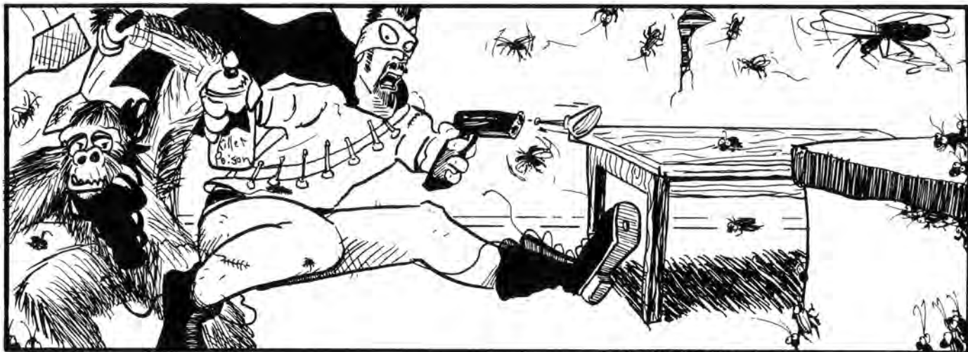
IT AIN'T OVER YET, Buckaroo