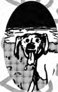
Max - Bad Dog!

Everything © 1997 by the Laughing Buddha Press, 1306 broadmoor, Austin TX. The Budget Strip is published quarterly. Any resemblance to any persons or institutions, living, dead, or otherwise is a fiction created by your own twisted mind. Why are you still reading this?