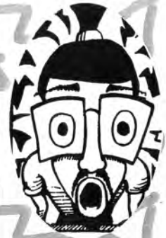
Den - Backup Vocals